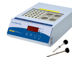
N2400-4002 Dry Bath System (Dual Block), shown with blocks N2400-4105 and N2400-4103.