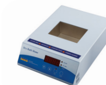
N2400-4001 Dry Bath System (Single Block).