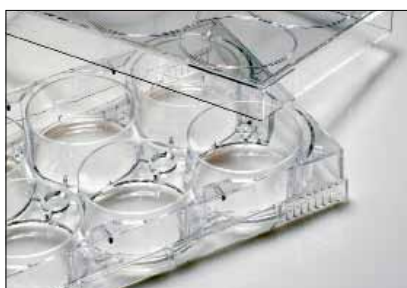
Complete chimney wells for 360° cross contamination prevention and gripper area on base for secure handling.