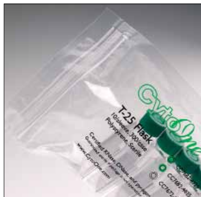
Easy-open, resealable zip top sleeve.