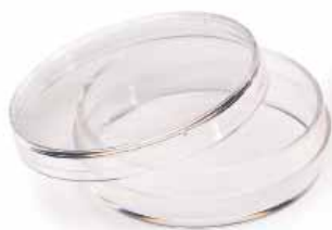
Grip tags on 150 mm dish lids for easier lid removal.