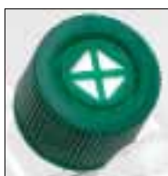
Filter cap for gas exchange and exclusion of contamination.