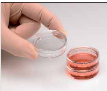
Beveled base for easy handling of 35 and 60 mm dishes.