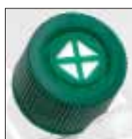
Filter cap for gas exchange and exclusion of contamination.