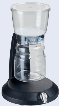
Pedestal shown with 500 ml Bottle Top Filtration Unit