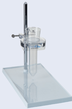
Cradle Ring shown with 50 ml Centrifuge Tube Filtration System (Stand not included)