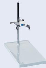
CC6000-1122 (Stand not included)