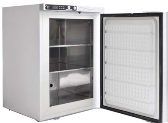
The freezer is supplied with two, height adjustable stainless steel shelves