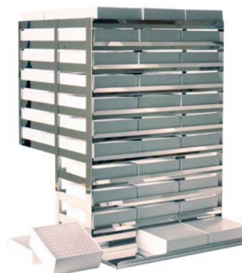
N2700-1001 (Boxes sold separately)