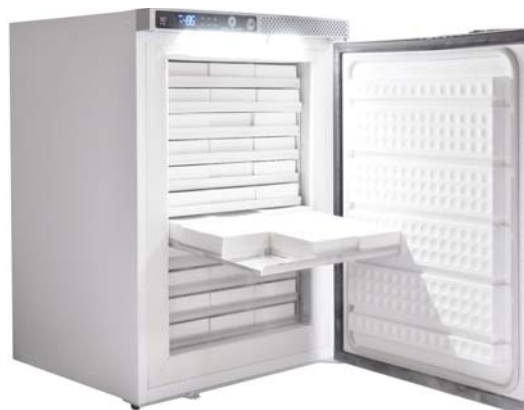
Maximise your storage space with the perfect-fitting stainless steel racking (sold separately) to hold either 50 mm, 75 mm or 100 mm high standard storage boxes.